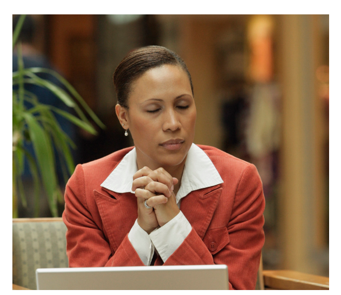
Each path has results and consequences. Choose the path of good. This is where you acknowledge that it is God and Him alone that gives me power to create wealth.

It is therefore important as an enterprenuer to have a spiritual compass against which you make judgement as you navigate your daily challenges and pains. And yes, it is within our powers to solve most of these pains, but it is easier when you call out to a higher power to be part of your solution. God is my higher power. What a good place to be!